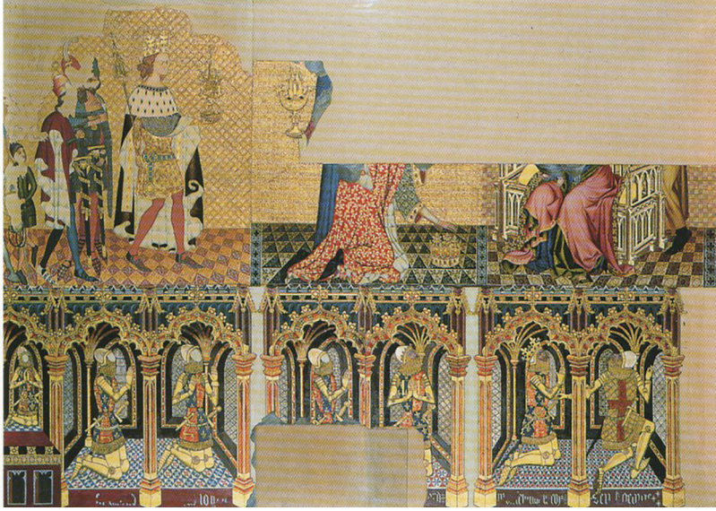
Fig.4 North side of the altar murals, St. Stephen's Chapel, Westminster, copied by Richard Smirke, c 1800-11, Society of Antiquaries of London