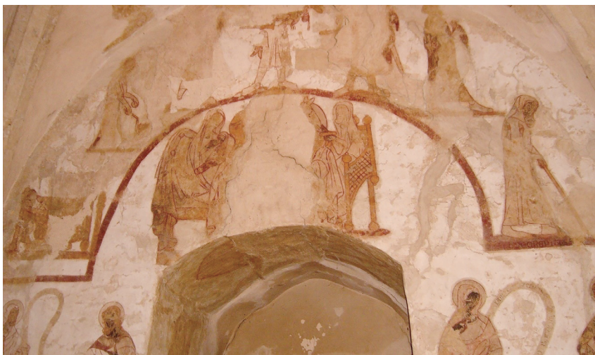
Fig.3 Nativity on the south wall of the Great Chamber in Longthorpe Tower, c. 1330