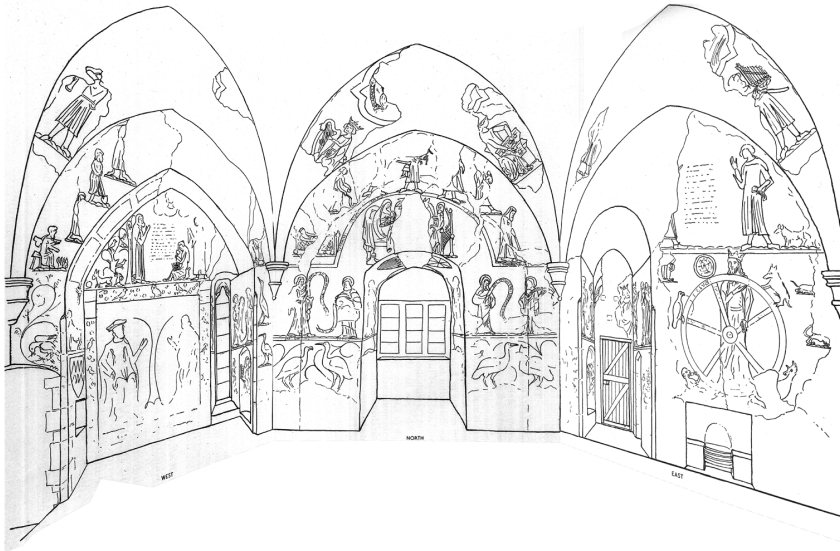
Fig.2 The murals seen from the South

Especially, I'd like to draw attention to the face-to-face relation between the dialogue scene and the Nativity (Fig. 3). The Nativity in Longthorpe Tower is certainly related to Edward's